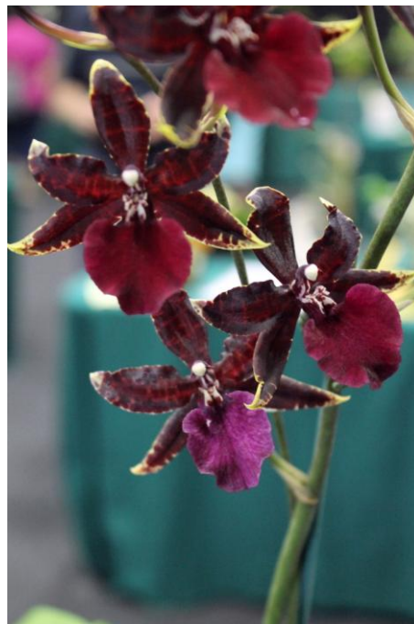
Ons. Dark Day ‘Copper Beech’ (GRAND CHAMP)