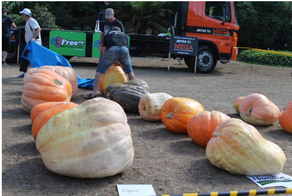
The Pumpkin festival coincided with the Waikato Show

Please try and support our local RSA who have been very generous with their support for our society by giving us the use of their hall at a heavily discounted rate.