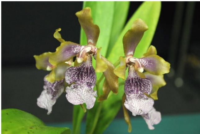
Onc. harryanum (above)

11 th May; 8 th June; 13 th July; 10 th Aug; 14 th Sep; 3 rd Oct (show set up); 4 th Oct (Show); 19 th Oct; 9 th Nov; 14 th Dec.