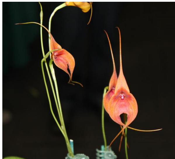
Masd. Copper Angel x panguiensis (above)