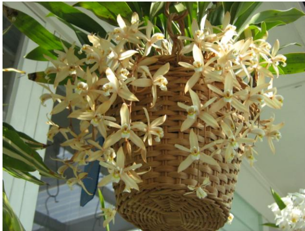
(Above) Coelogyne flaccida , these make great specimens.

(Right) An amazing range of superb Aussie Dendrobiums displayed in 1 of 4 houses. Don't you just wish there were still nurseries like this to visit locally? This was taken at Sunrae Orchid Nursery in Drury on a club visit back in 2008. Even further back there were a lot more to choose from selling a large variety of quality orchids.