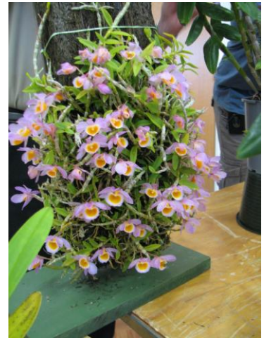
Right: A well grown ponga mounted Den. loddigessii