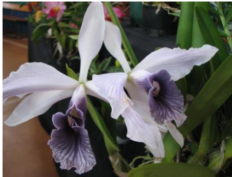
Above: Laelia purpurata