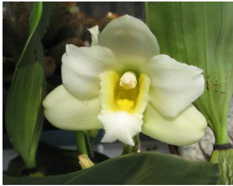
Bifrennaria harrisoniae var. alba