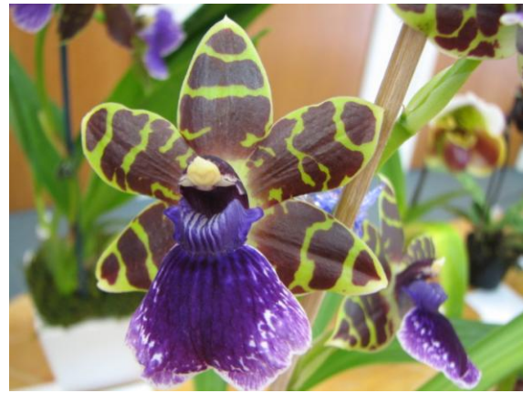
(Above R) A nice Zygopetalum . This will be very similar to those sold.