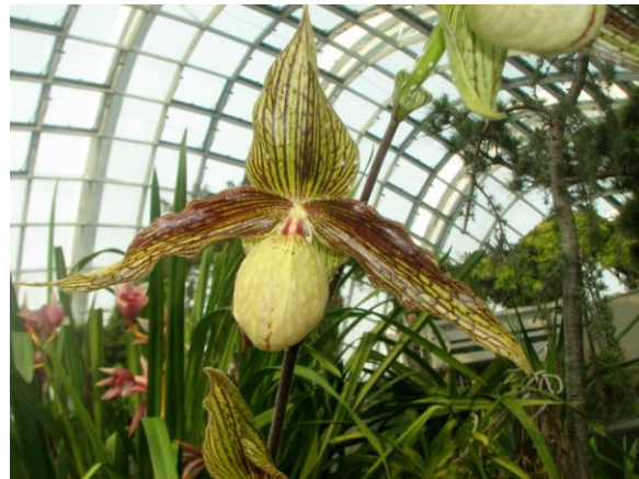
Paphs grown in natural surroundings in the Cloud Forest