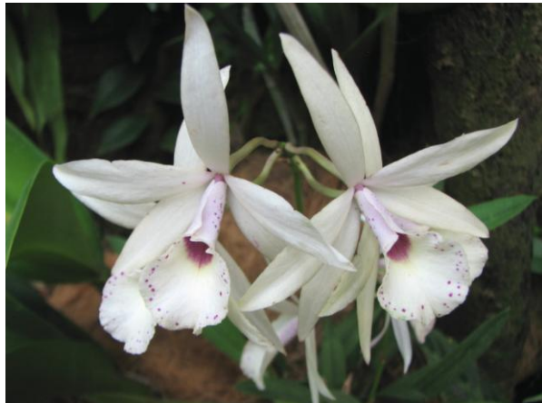
Above: a Cattleya a little different from the usual Right: a very pale form of Arundina graminifolia

Plants were down as most were at the NZOS show where our display won 2 nd prize.