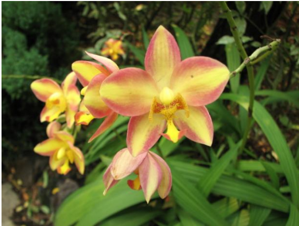
Above: Spathoglottis a warm growing terrestrial seldom seen in NZ. Modern hybrids come in a good range of colours. They flower sequentially so flower for a long time. Botanic garden, orchid garden.

Grahame Leafberg – AD award for Cymbidium on HOS display