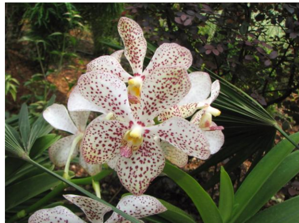
Above: A Mottled and Spotted Vanda, Botanic garden orchid shade house.