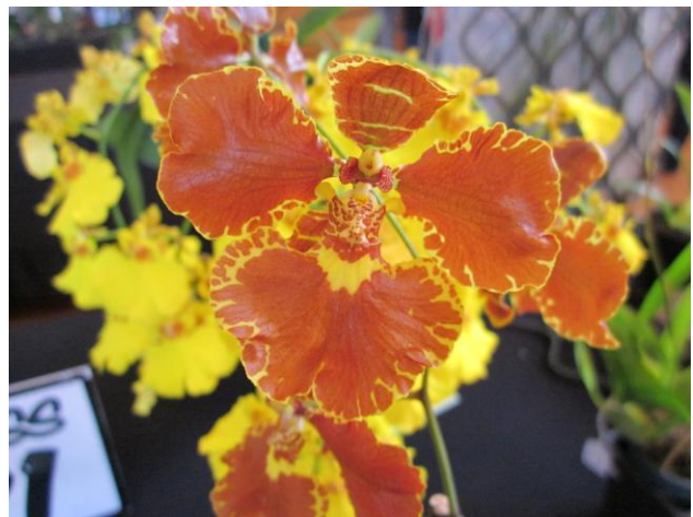
Onc. Bronze Medallion at NZOS Show

Tolumnia Barbie x Golden Caledonia at NZOS Show