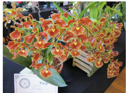
Onc. forbesii at NZOS Show

To help new members someone will be on duty near the entry desk to help you out with any problem plants you may have or questions on culture. So don't be shy about bringing in those plants or asking questions.