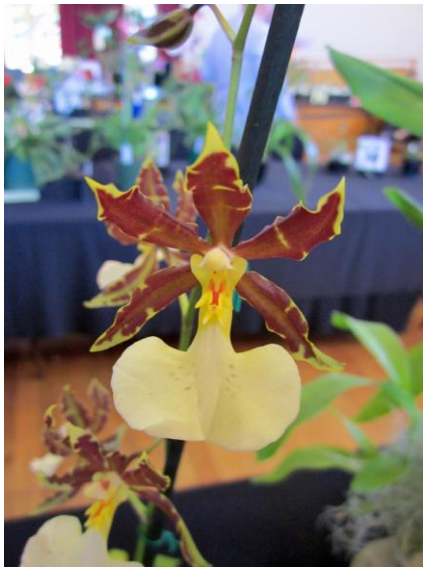
Onc. tigrinum at NZOS show