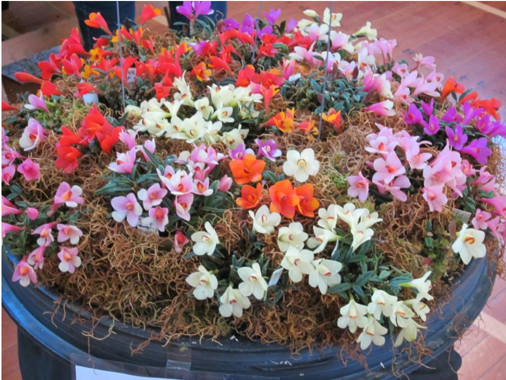
A bowl of Den. cuthbertsonii at Te Puke Lions Show

Otherwise please feel free to ask people at the club as there are always plenty who can help you. Unfortunately we don't always get enough time on club days so it is important to attend some of the social events we organize so you can talk to others in a more relaxed atmosphere.